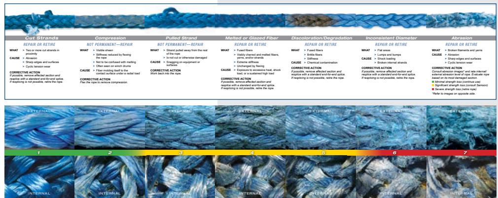
The Pocket Guide includes information on proper rope inspection techniques and corrective action steps.