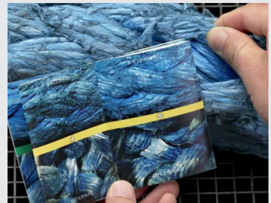
The comparator is an easy reference that can be used in the field to help assess the state of a rope. Small and easily held in the hand while performing an inspection, it helps establish a guideline and a common language when discussing the state of a rope.