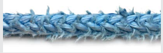
Abrasion occurs both externally, along the surface of the rope and internally, inside the structure of the rope. It is important to evaluate both forms to accurately assess the condition of the rope.

The comparator is an easy reference that can be used in the field to help assess the state of a rope. Small and easily held in the hand while performing an inspection, it helps establish a guideline and a common language when discussing the state of a rope. It is printed on extremely durable synthetic paper that is resistant to tearing and comes packaged in a vinyl sleeve to make it 'pocket friendly.'